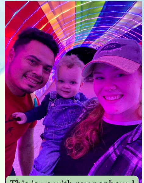
This is us with my nephew, I used to watch him while his mom worked.