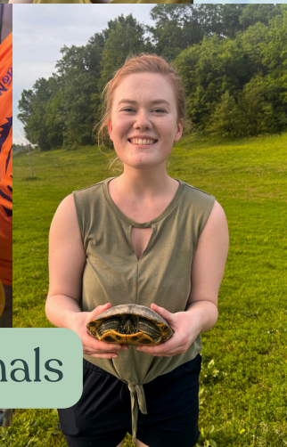
She LOVES animals