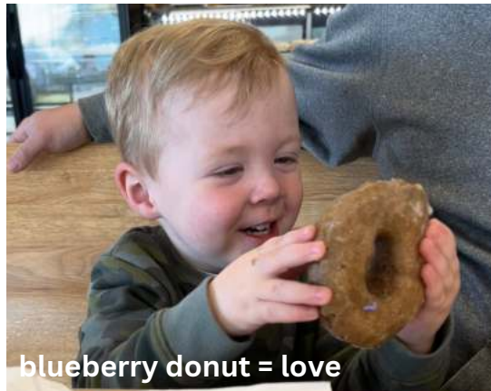
blueberry donut = love