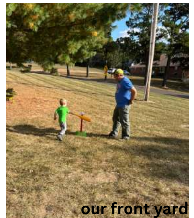
our front yard