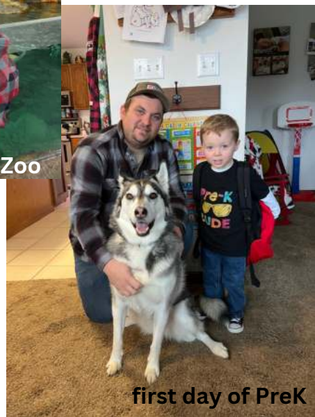
first day of PreK