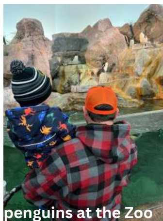
penguins at the Zoo