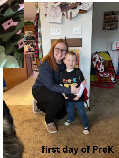
first day of PreK