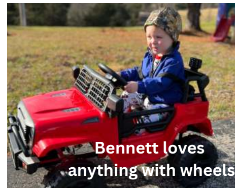
Bennett loves anything with wheels