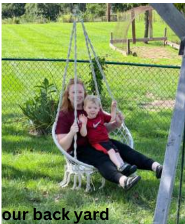
our back yard