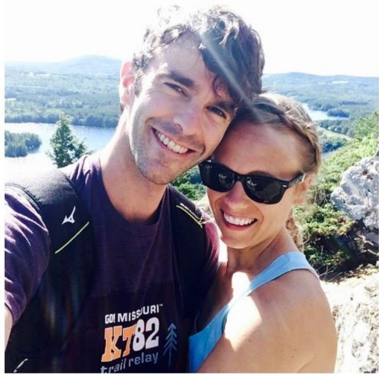
Where we got engaged!

We knew pretty quickly that we had found our person!