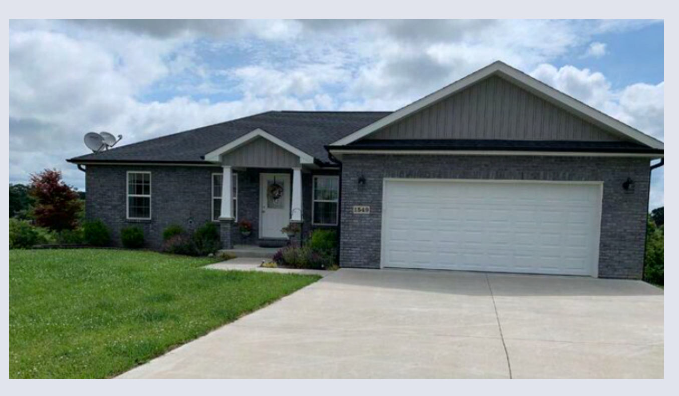
We live in a quiet, family-friendly neighborhood in a medium-sized town.