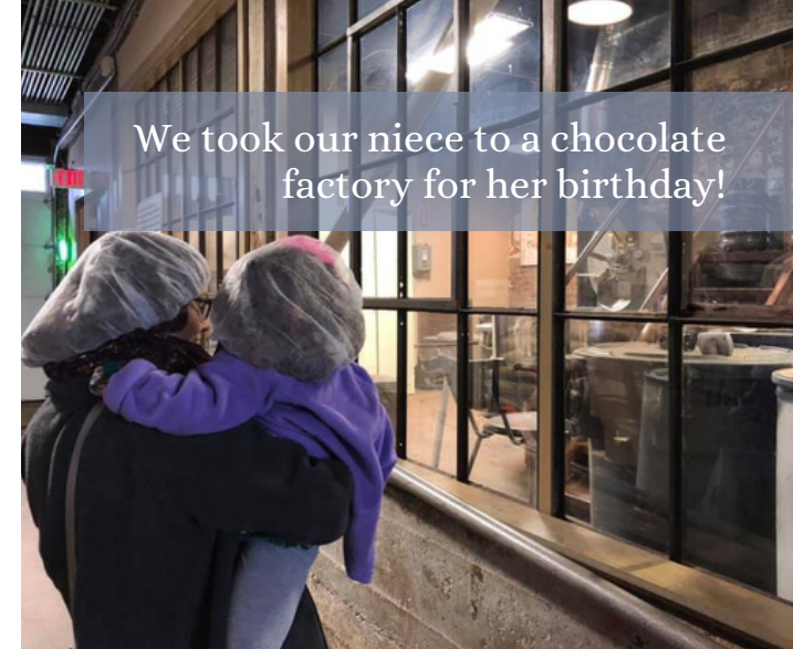
We took our niece to a chocolate factory for her birthday!