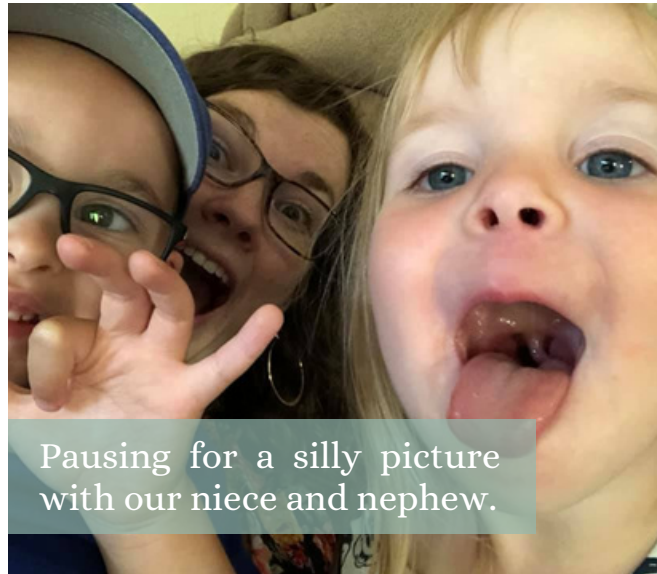
Pausing for a silly picture with our niece and nephew.