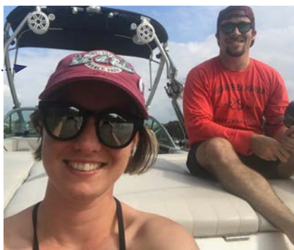
We spend all summer on our brother's boat.

BOATING | Kelly's parents and siblings live very close to a small lake and have a boat on the water. We spend all summer on the boat skiing, cruising, and swimming. Because of our passion for water, our child will learn how to swim and learn how to be safe in water early on.