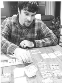
Playing a board game called "Wingspan"

BOATING | Kelly's parents and siblings live very close to a small lake and have a boat on the water. We spend all summer on the boat skiing, cruising, and swimming. Because of our passion for water, our child will learn how to swim and learn how to be safe in water early on.